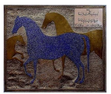
Figure (17), Three Horses, Master Mohammad Tamim Sahibzadeh, Silver Sheet and Mineral Paints, 2014.

From these works, it can be concluded that there have been artistic exchanges between artists from Herat and Iran.