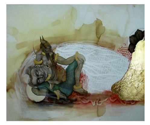
Figure (20), Buddha, by Khadem Ali, Kabul, Source: From Khadem Ali's website.

between Persian-speaking immigrants and the host language community. Artists individually or in small groups were engaged in artistic activities in the field of visual arts. Therefore, the ground was not prepared for the cultivation of the young generation of poets. But in painting and painting, due to the interest of Pakistani artists and the usual trend of painting in that particular style, he also encouraged immigrant painters to paint in the style and context of the host country. This could have happened for several reasons. One is to create jobs for Afghan artists in Pakistan who have had to learn how to paint. Another reason is the market for the sale and purchase of works of art and the request of permanent