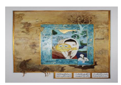
Figure (13), Women of Today and Yesterday Afghanistan, Soghari Hosseini, Calligraphy: Abdolhadi Fahim with Technique: Gouache and 2014, Watercolor, Kabul, Dimensions: 30 \times 40

The influence of Western and modern methods on painting and at the beginning of the work is