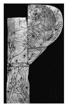
Figure (4), Design of two winged valves, engraved on white ivorv. Bamvan

On both sides of the Hindu Kush region, Afghanistan has had advanced agriculture and irrigation,