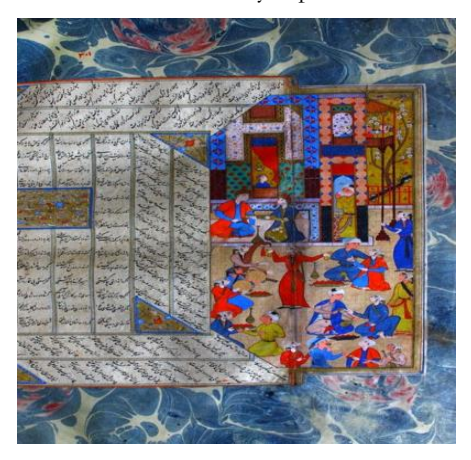
Figure (8), Image of one of the pages of the manuscript, Source: National Archives of Afghanistan.