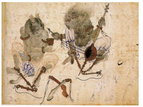
Figure (23), Two demons with dragons, Master Mohammad Siah Ghalam, Tabriz, about 800 to 850 AH, reference 2153 Topkapi Museum of Istanbul

customers for paintings painted through active art centers in Pakistan, and immigrant artists working in these centers tried to attract customers and those in charge of the art center. Perhaps another reason was the small payments and the use of natural and organic materials that matched the artistic origins of Afghanistan, and young painters sought to bring themselves closer to the cultural and artistic origins of their homeland.