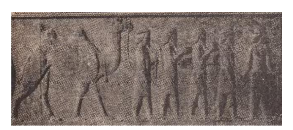
Figure (1), Some Ancient People of Afghanistan in the Prominent Roles of Persepolis, Balkhian, Source: A Brief History of Afghanistan, Abdul Hai Habibi.

Since Afghanistan has been at the center of civilization, especially in the eighth and ninth centuries AH, has led to the emergence of unique artistic styles and trends, the emergence of many literary, scientific and artistic figures. Its special branch, which is a branch of traditional insights and