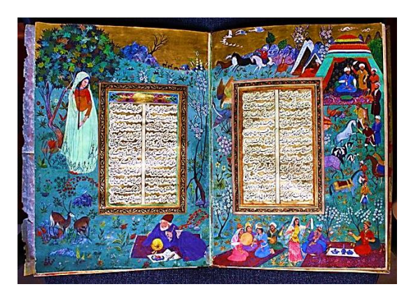
Figure (6), "An Ode to the Divan of Farrokhi Sistani's Poems in the Descent of Amir Abu al-Muzaffar Fakhr al-Dawlah Ahmad ibn Muhammad, Governor of Chaghanian", a calligraphy by Seyyed Mohammad Daud Hosseini Afghanistan National Archive - Treasure of the country's spiritual resources.

When the West and its influence entered the East with a new perspective, it took the image of Eastern art and civilization to the West, and Western elements also influenced Eastern art. The West's irreconcilable acquaintance with Islamic art and the region's particular artistic tendencies intensified in the mid-nineteenth century. More detailed studies of Islamic art began.