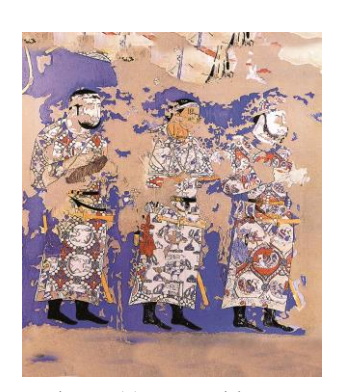
Figure (5), Sassanid princes, muralist, Afrasiab stratum, Panjikent, 7th century

expanding world religions and playing an important role in trade and commerce. They have been to Asia. Thus, Afghanistan has historically been the scene of attacks by invaders and explorers, whose footprints can still be seen in every corner of the land "(Herbert, 56). The ancient land of Afghanistan, according to historical evidence, has a history of nine to twenty thousand years BC. But the roots of civilization, which indicate the existence of people with culture and civilization, are almost three thousand years BC. Therefore, the art of this region, which was one of the main features of its civilization, has a long history.