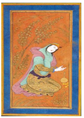
Figure (11) The daughter of Figure (10), the daughter the king of the Second of the king of the second Climate, a page from the climate, a work by Reza manuscript of Haft Orang Abbasi, source: Jami, probably from a book of Islamic Iranian manuscript made in the Islamic design early twentieth century, source: National Archives of Afghanistan.