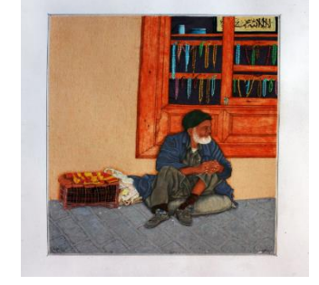
Figure (22), Pirmard, Ahmad Masih Farhad, Dimensions: 20 × 30, 2014, Source: Turquoise Mountain Institute Photo Archive

modern approach. Artists who had learned art during their migration to Pakistan worked in the direction and style of Pakistani artists; however, they were more likely to follow local principles when choosing a subject. The painter created a picture of narrative literature, myths and religious concepts with a modern look and a new style. The simultaneous view of the country's captive indigenous traditions and culture and the attitude of leading artists in the field of Western art was not hidden from the view of the Afghan painter in Pakistan. A clear example of this method and view can be seen in the drawings of