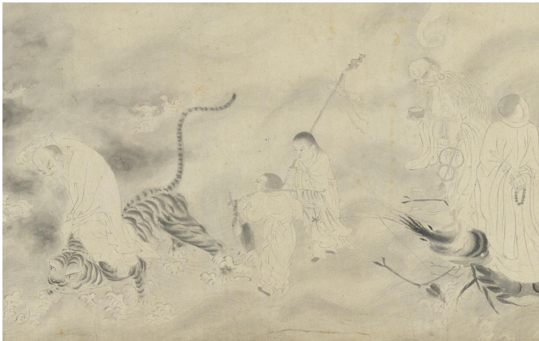
Figure 1. Eighteen True Volumes by Wu Bin in The Ming Dynasty

In the Ming and Qing Dynasties, Fujian line drawing art ushered in a golden period of vigorous development. During this period, a number of outstanding line drawing artists emerged in Fujian, such as Li Zai, Zeng Jing, Wu Bin, etc. Their works have their own characteristics and jointly promote the prosperity and development of Fujian line drawing art. Li Zai's line drawings of the characters are vivid in modality, simple and smooth in line, and express the charm and emotion of the characters incisively and vividly; The "bochen school" founded by Zeng Jing, with its unique concave convex painting method, has created a new chapter in ancient Chinese portrait painting; However, Wu Bin's line drawing characters are deeply influenced by the figure paintings of the Tang and Song Dynasties, and can create strange and different characters on their own. His artistic achievements are even more amazing.